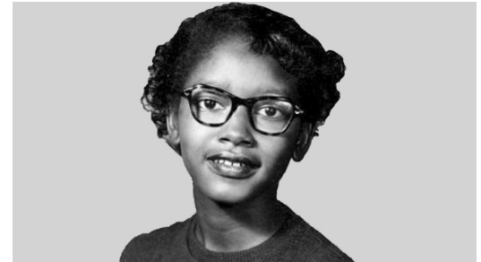
15 year old Claudette Colvin - 1955

GNBVT Celebrates Black History Month! Every year the theme for Black History Month changes, this year's theme is “Black Resistance: A Journey to Equality” . As I reflect on those words, what comes to mind was the stance that Rosa Parks took with not giving up her seat on the bus. Did you know, before Rosa Parks, a 15-year-old gifted Black student named Claudette Colvin, who had aspirations to become a civil rights attorney, took a window seat near the exit door. She gazed outdoors until the white driver instructed her to give up her seat for a white passenger standing nearby. Claudette Colvin refused. The resistance she had is truly something to admire! To understand equality is to understand that every individual has an equal opportunity to make the most of their lives and talents!