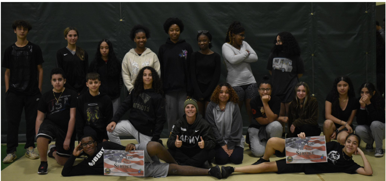
Students Recognize Veteran's Day