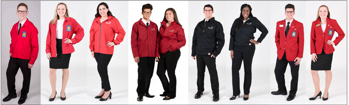
SkillsUSA Official Attire Options