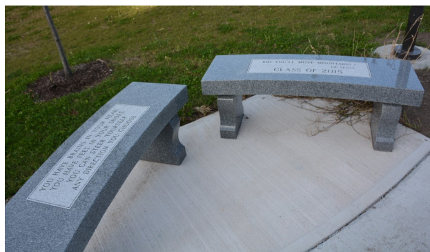
Benches outside the new cafeteria courtyard donated from the Class of 2015

TO POST OR FIND INFORMATION ABOUT CLASS REUNIONS VISIT OUR WEBSITE OR FACEBOOK PAGE.